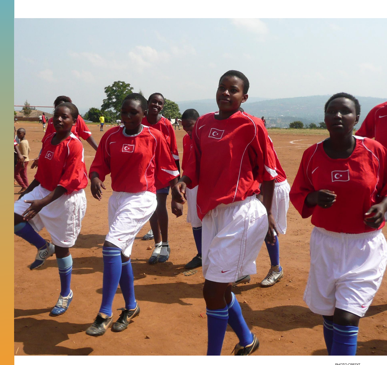
AKWOS, Rwanda, 2011

conditions and events that are known and reasonably knowable at the date that the financial statements are issued. Whilst uncertain, we do not believe, however, that the impact of the Covid-19 virus would have a material adverse effect on our financial condition or liquidity.